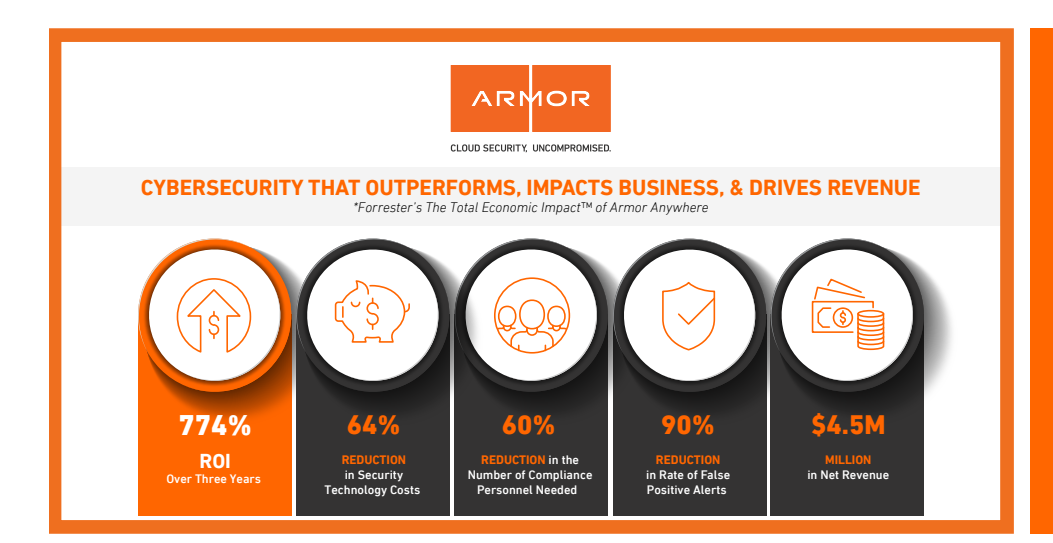
Figure 1. Key findings from a Forrester Total Economic Impact study of Armor Anywhere

In August 2020, Armor was recognized as a Representative Vendor in the Gartner "Market Guide for Managed Detection and Response Services."<sup>8</sup>